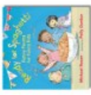
Ready for Spaghetti Michael Rosen & Polly Dunbar