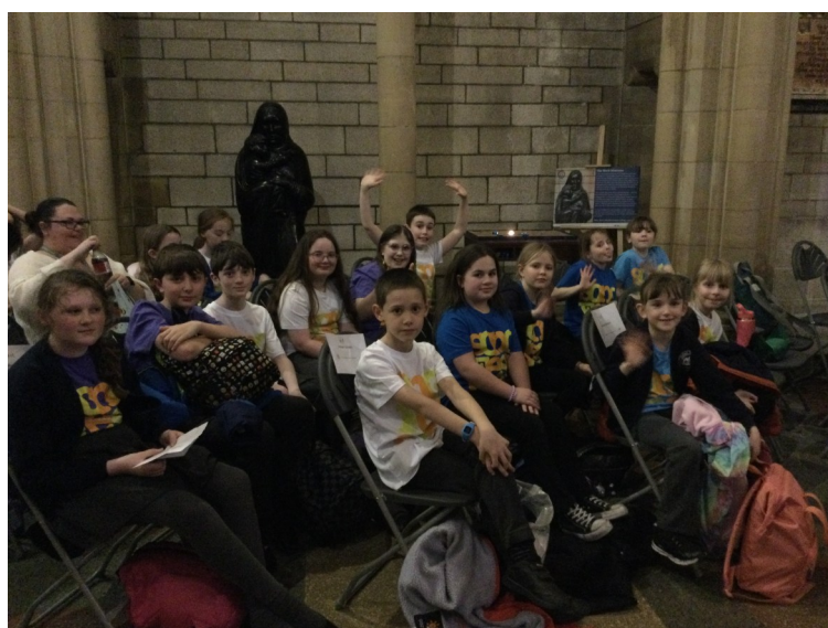
Choir—SongFest Truro Cathedral